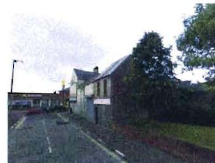
View from Connawater Street