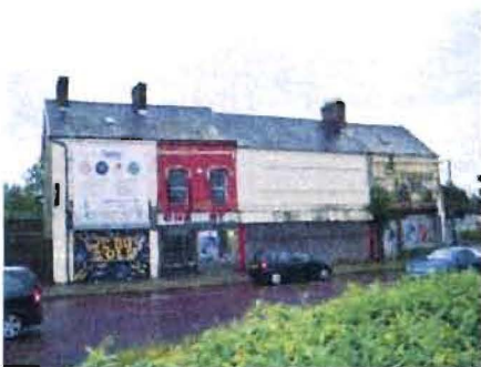
Current buildings at 380-390