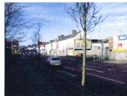
View towards Belfast city centre