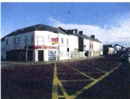
View towards Upper Newtownards Road